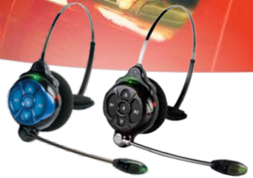
Compatible with ION | IQ® and EOS | HD™ Drive-Thru Headset Systems

The all-new CIB connects your Matrix POS drive-thru headset system to Matrix POS CLOUD. Easily update message center reminders, greetings and alerts across multiple stores simultaneously. Save valuable time with remote troubleshooting, and receive timely system updates.