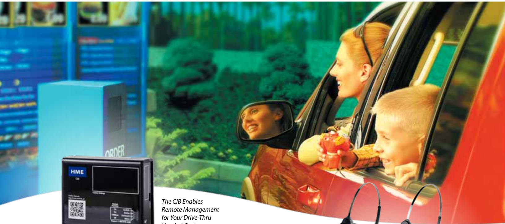
The CIB Enables Remote Management for Your Drive-Thru Headset System